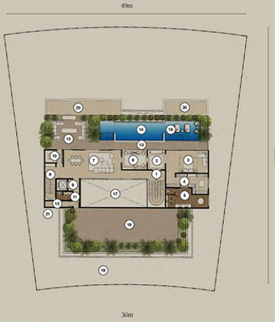
TYPE 03 PLUS / SECOND FLOOR | Master Bedroom Option