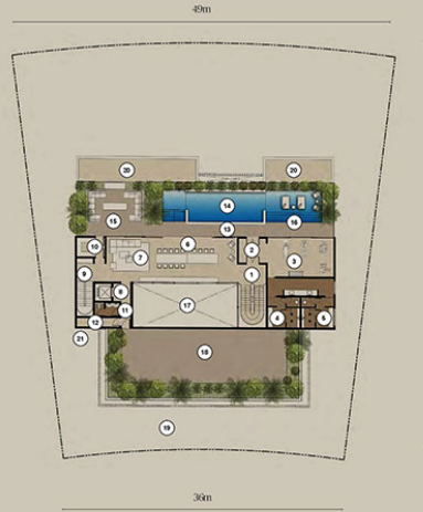
TYPE O3 PLUS / SECOND FLOOR | Family Room Option