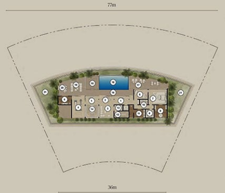
TYPE 01 PLUS | SECOND FLOOR | Master Bedroom Option