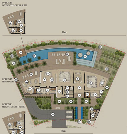
GROUND FLOOR | Option 1