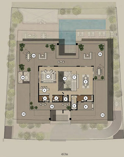
TYPE O4 PLUS / SECOND FLOOR | Guest Entertainment Option