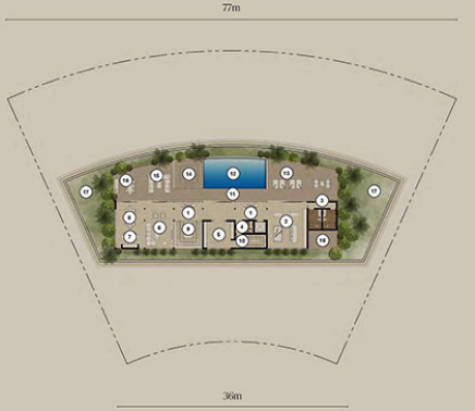
TYPE 01 PLUS | SECOND FLOOR | Family Entertainment Option