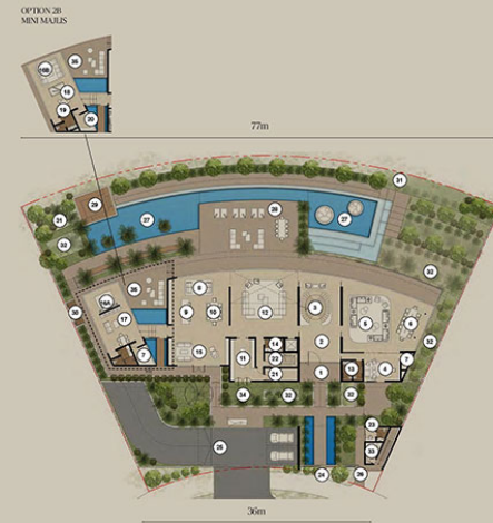
GROUND FLOOR | Option 2