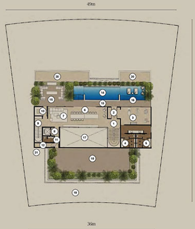
TYPE 03 PLUS / SECOND FLOOR | Family Room Option