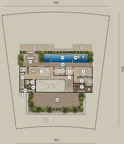
TYPE O3 PLUS / SECOND FLOOR | Master Bedroom Option