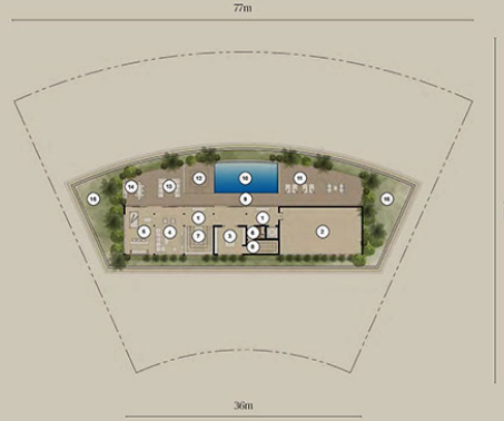
TYPE 01 PLUS | SECOND FLOOR | Guest Entertainment Option