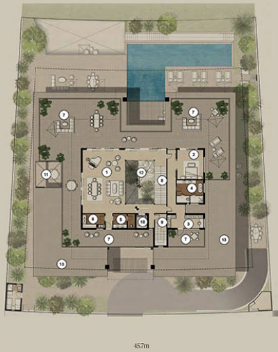
TYPE O4 PLUS / SECOND FLOOR | Master Bedroom Option