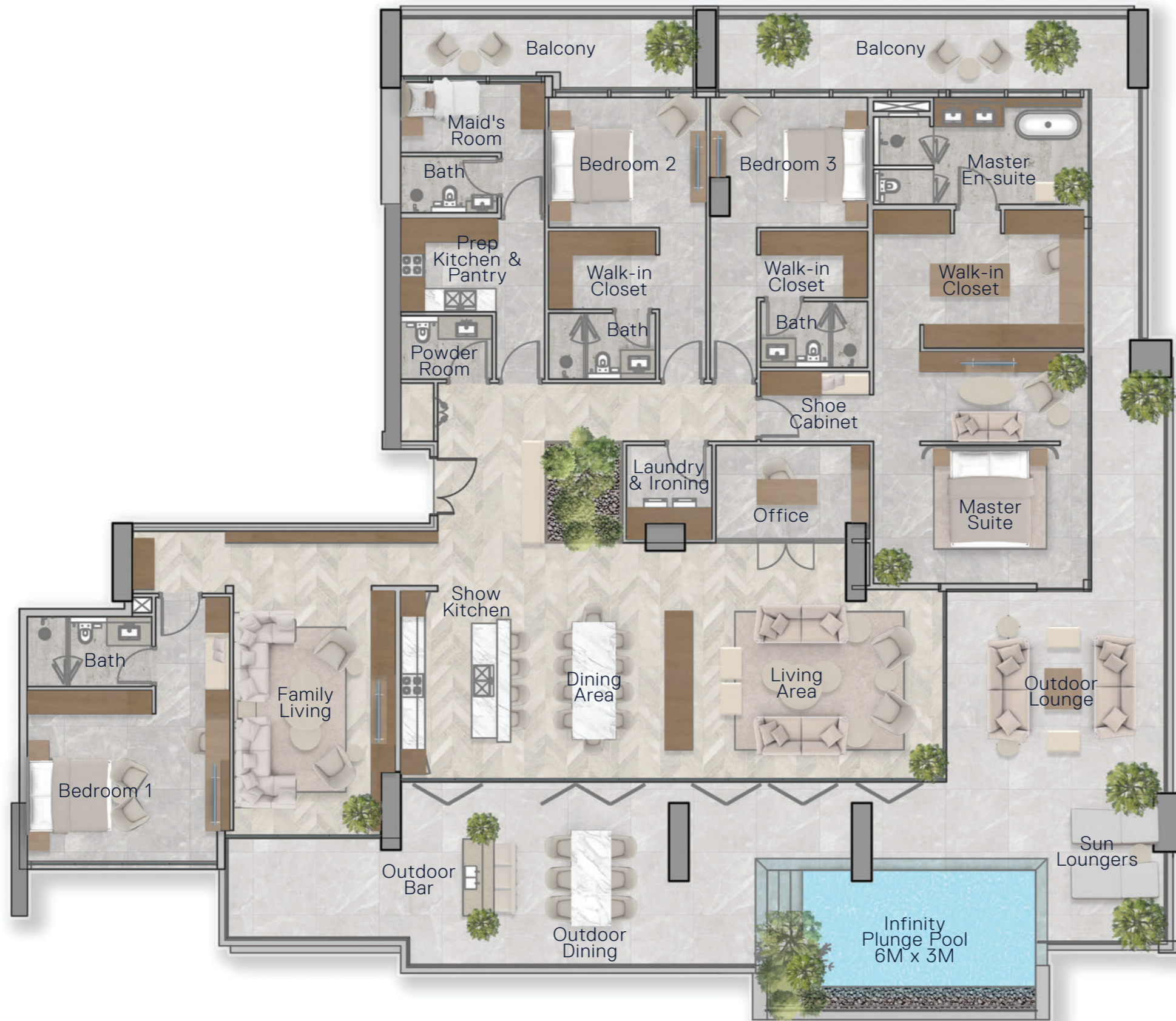
21 st Floor