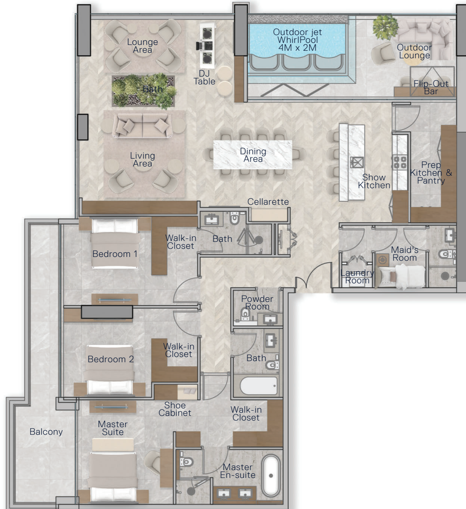
21 st Floor