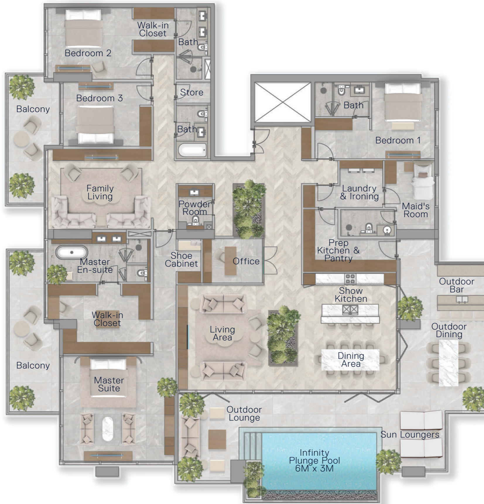
21 st Floor