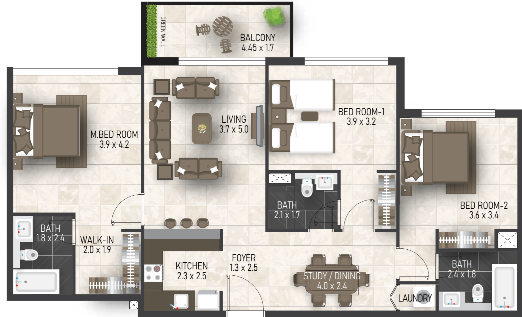
3 BED - Type 1A 118.54 sq. m (1,276 sq. ft)

Disclaimer: All design, features, amenities, materials, dimensions, and layout drawings are approximate and subject to change without prior notice. The actual area of the Unit may vary from the stated area; drawings are not to scale. The developer reserves the right to make revisions to comply with any Applicable Law or the requirements of any Relevant Authority. For exact sizes please refer to the Unit Purchase Agreement.