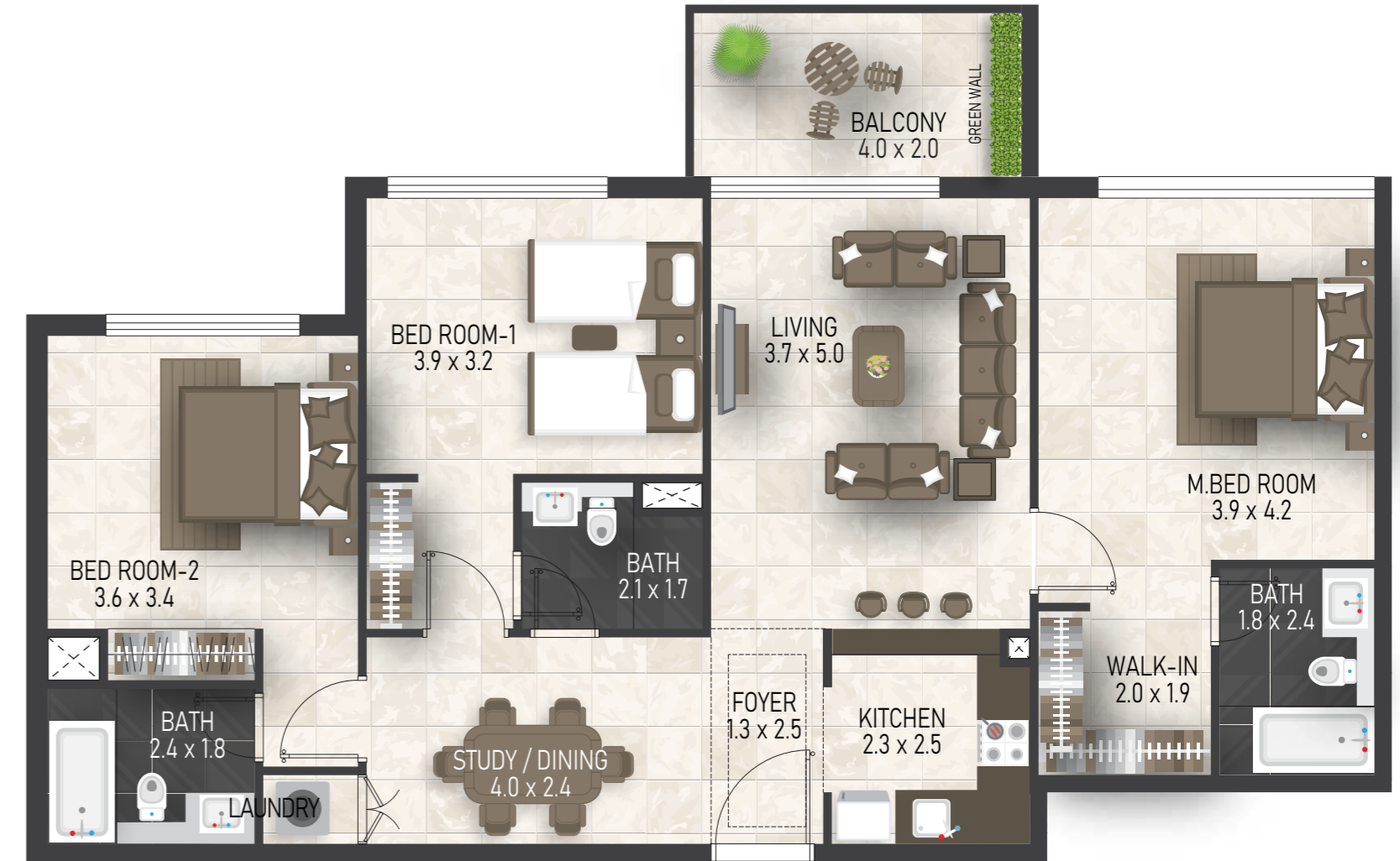
3 BED - Type 1B 118.35 sq. m (1,274 sq. ft)

Disclaimer: All design, features, amenities, materials, dimensions, and layout drawings are approximate and subject to change without prior notice. The actual area of the Unit may vary from the stated area; drawings are not to scale. The developer reserves the right to make revisions to comply with any Applicable Law or the requirements of any Relevant Authority. For exact sizes please refer to the Unit Purchase Agreement.