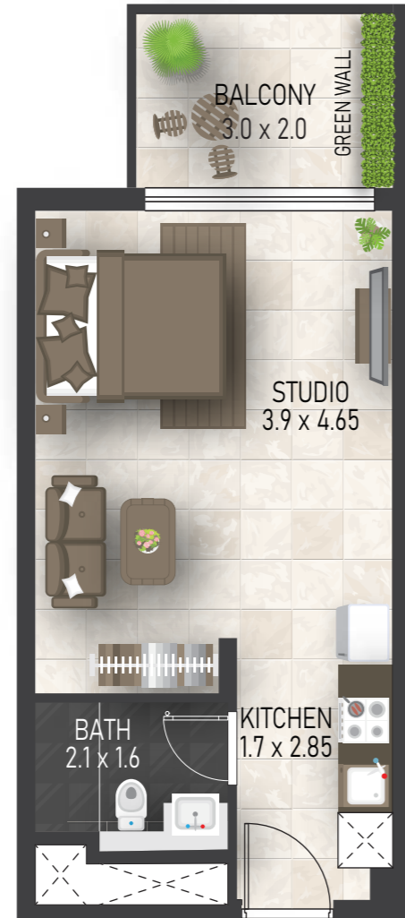
STUDIO - TYPE 1A 37.06 sq. m (399 sq. ft)

Disclaimer: All design, features, amenities, materials, dimensions, and layout drawings are approximate and subject to change without prior notice. The actual area of the Unit may vary from the stated area; drawings are not to scale. The developer reserves the right to make revisions to comply with any Applicable Law or the requirements of any Relevant Authority. For exact sizes please refer to the Unit Purchase Agreement.