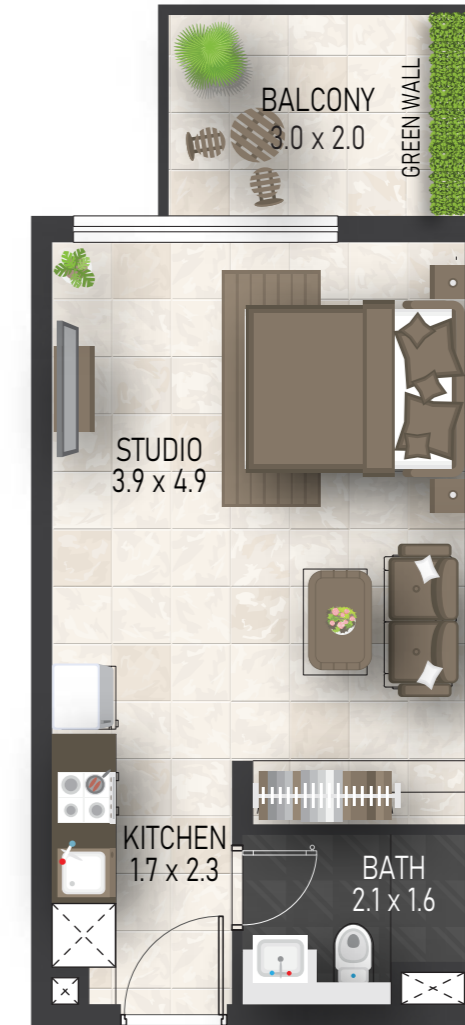
STUDIO - TYPE 1B 36.04 sq. m (388 sq. ft)

Disclaimer: All design, features, amenities, materials, dimensions, and layout drawings are approximate and subject to change without prior notice. The actual area of the Unit may vary from the stated area; drawings are not to scale. The developer reserves the right to make revisions to comply with any Applicable Law or the requirements of any Relevant Authority. For exact sizes please refer to the Unit Purchase Agreement.