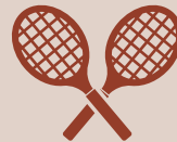
Squash & Tennis Court