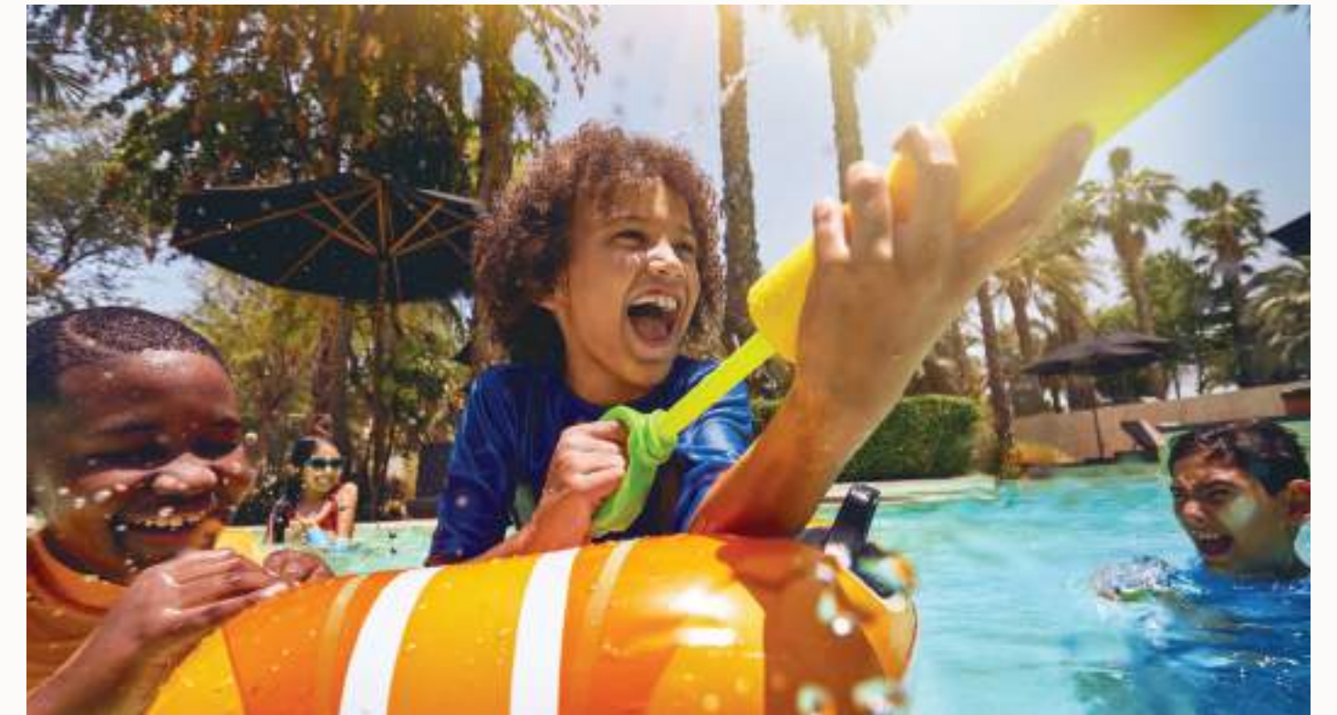
Swimming pools, splash pads and kids' play areas