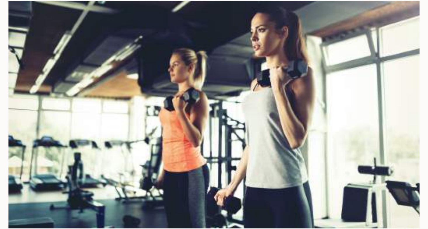
Gyms, outdoor wellness and fitness areas