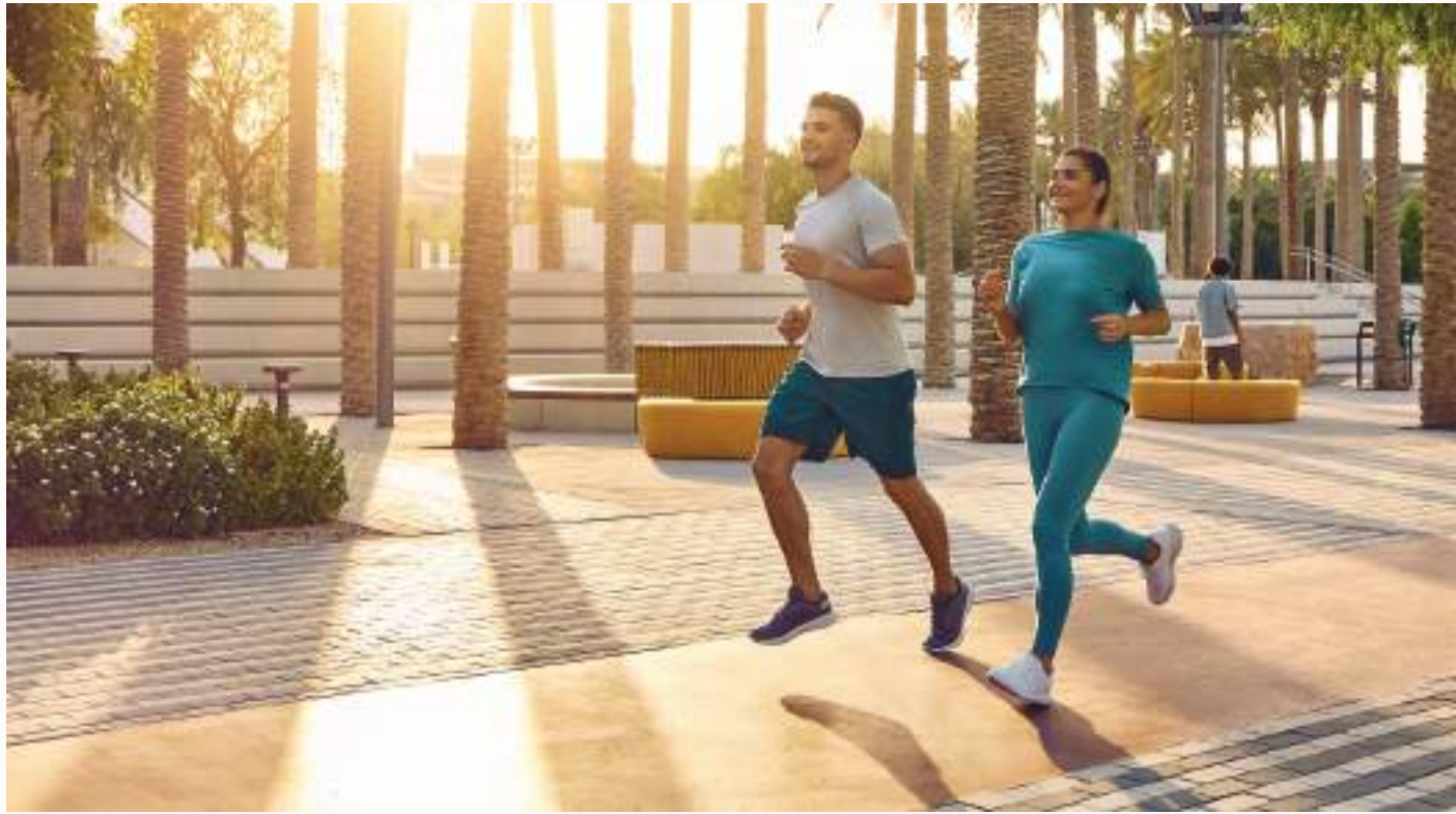
4.5 km of pedestrian tracks and 5.2 km of cycling trails