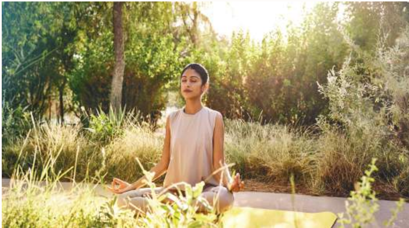
Yoga studio, health & beauty salon, spa and sauna